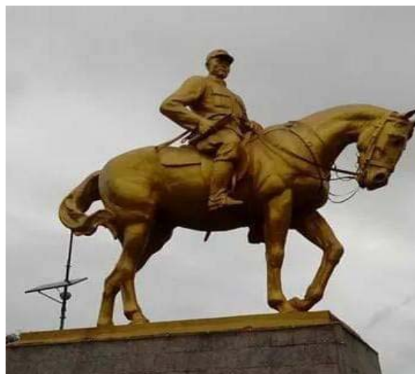
August 1911, Myanmar